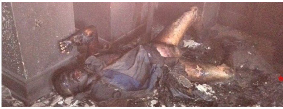
Neither young or old were spared ... and not a weapon in sight

Even more simply , as long as CNN, the New York Times and Washington Post can be controlled, and "forever" is an understatement, world leaders will, for the most part, remain silent, fearful of being cast in the role of "conspiracy theorist" or, worse yet, suffering the fate of Gaddafi or Chavez.