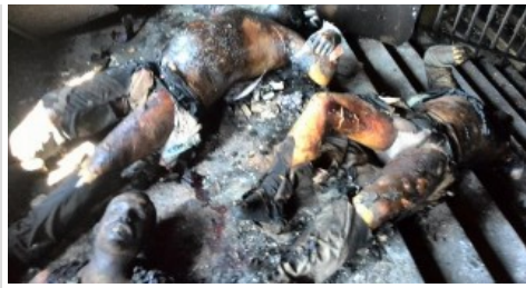
A hard way to die

The western press will never show the photograph of a pregnant woman, strangled with a phone cord around her neck, still at her desk, carefully staged, standing erect. Even the language alone describing other hideous scenes would be enough to trigger Google censors.